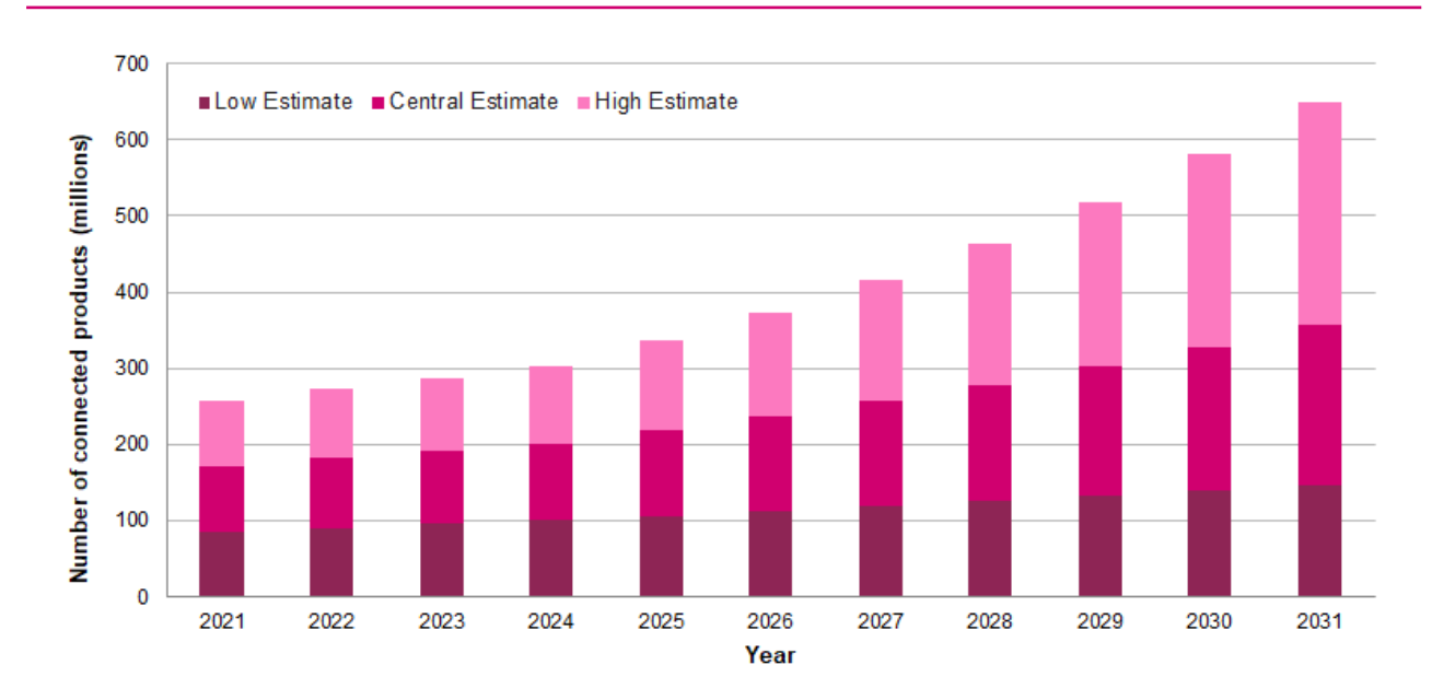
Graph 1 - Estimated growth in consumer connectable products in the UK under three scenarios

Estimating the number of new product sold over the appraisal period